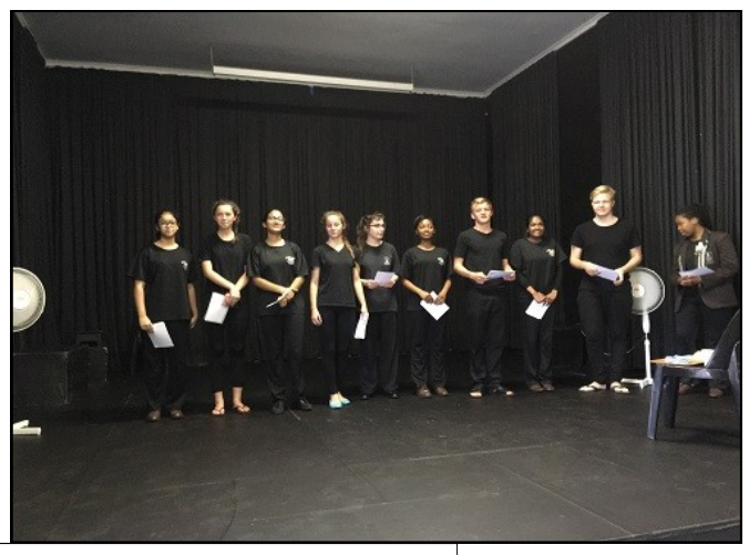
Candidates at the 2016 Monologue Competition